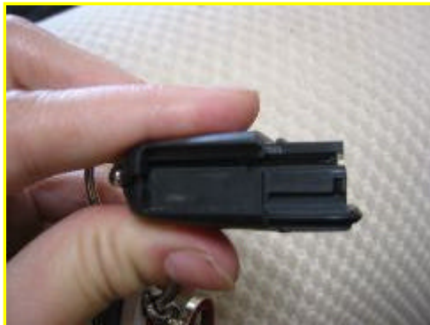
Here you can see where the two pieces separate.