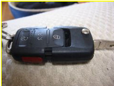
Step 1 is basically grab the key from both ends and pull hard.