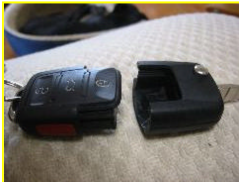
The key will separate into two halves.