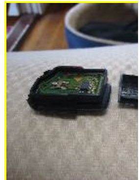
The rest is pretty simple. To replace the battery, do it in reverse order. Each piece goes back together normally.